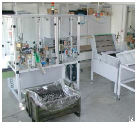
Photo 2+3: Typical system with test stations for crack detection and structure test. An optional master part run will guarantee constant test quality.

Cycle times from 3 seconds per part are achieved, with faster speeds from twin or triple designed systems.